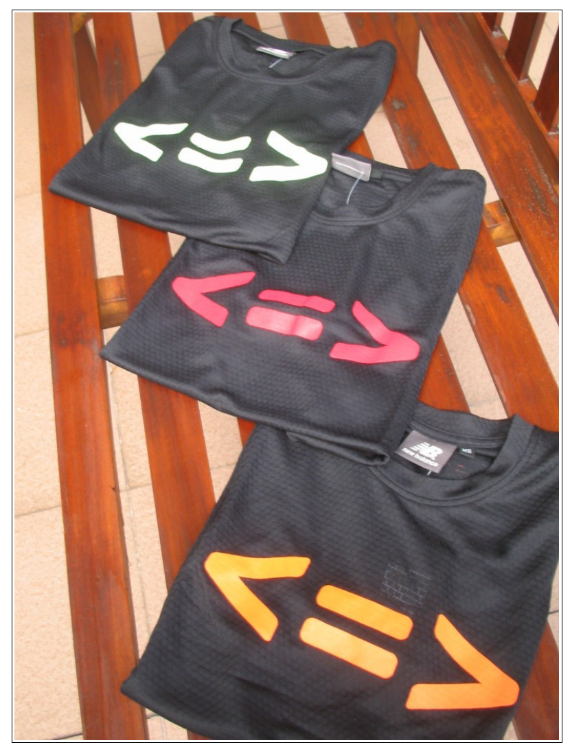
Available in Green, Red, Orange

These tops are available in store for $29.00 each. However, when you purchase a pair of New Balance Minimus, you will have the option of purchasing a Minimus Tee for just $10.00!