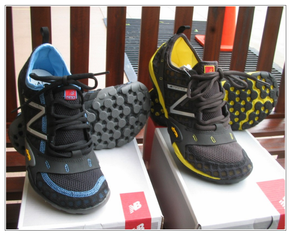
Women's on the left, Men's on the right