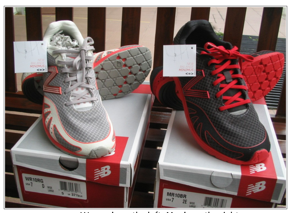
Women's on the left, Men's on the right

The Minimus is available in 2 models, one for the road and one for the trail.